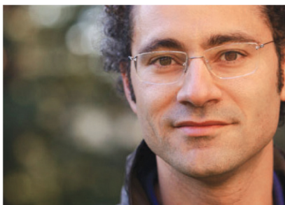
Dr Alexander Karp, CEO, Palantir Technologies

"After the 26/11 attacks, the Indian government has undertaken a sweeping revamping of its entire intelligence infra-