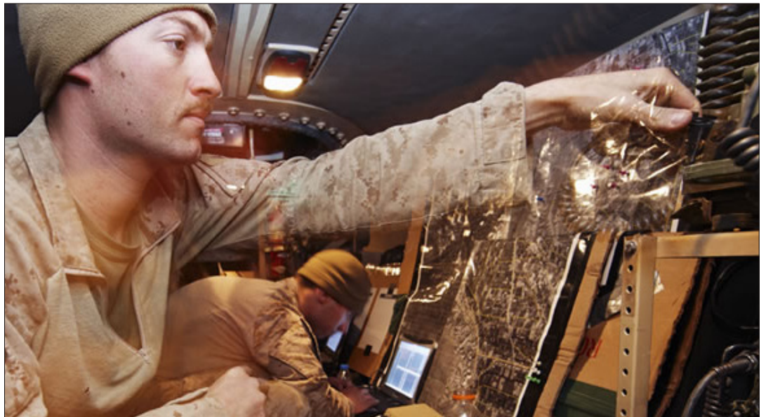
Palantir helps the USMC carry out critical missions as they scale back their presence in Iraq and Afghanistan.

As the Department of Defense scales back military operations in Iraq and Afghanistan, units on the ground are faced with the challenge of accomplishing their mission with fewer resources. The United States Marine Corps (USMC) turned to Palantir to help them maintain and even improve operational effectiveness during drawdown.